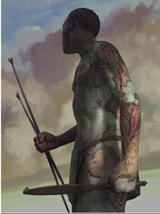
Figure 2. Artistic representation of the first humans. From Marean 2015a