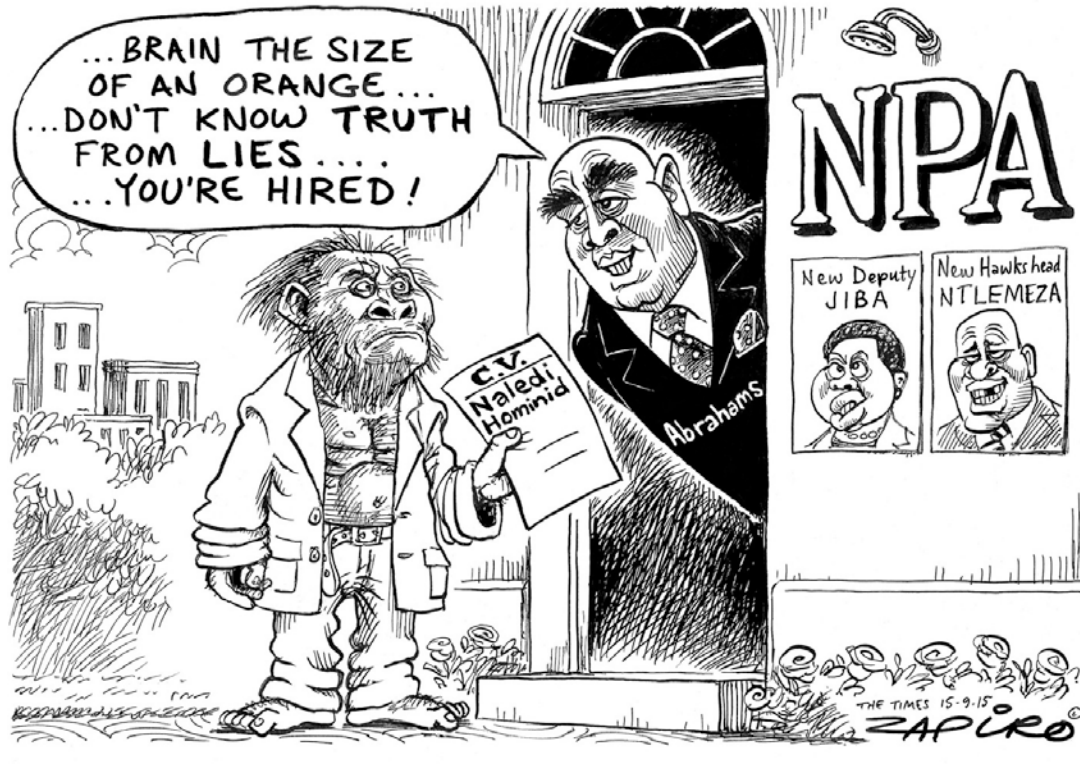
Figure 3. Cartoon run in South African newspapers explicitly links Homo naledi and living black members of the National Prosecuting Authority as a commentary on their intelligence and abilities. Cartoon by Zapiro, The Times © 2015. Re-published with permission.